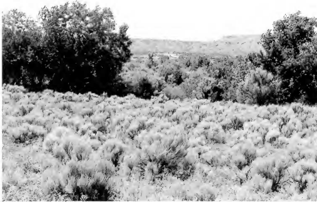
Figure 2. Typical riparian habitat along the Canadian River at Lake Meredith National Recreation Area. Dense vegetation at foreground is sand sage; mature cottonwood trees flank salt cedar and false willow in background.

1991). No specimens were taken during our survey and there are no records from Lake Meredith NRA. However, this species is known from Hutchinson County.